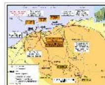
Apollo Minerals' Pilbara tenements

Shares in Apollo were unchanged in morning trade at A13.5c.